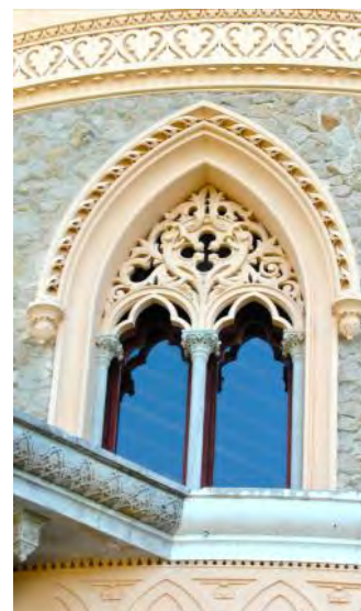
Monserrate Palace, Sintra, Portugal

About Focus Brazil The sixth edition of FOCUS BRAZIL - International Congress for Culture, Media & Brazilian community is marked by important debates on current topics of interest to more than 3 million Brazilians who live abroad. Focus Brazil is a free event, with simultaneous broadcast in English and Portuguese, open to professionals, students and the general public interested in Brazilian issues abroad. More than 700 participants and 80 media representatives from nine countries attended the event in 2010 and it is expected that it will be an even bigger event in 2011. For more information, visit www.focusbrazil.com or register by e-mail, in-fo@aotpsite.org .