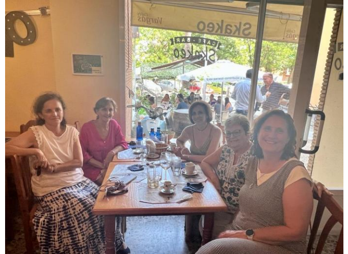
WITH FRIENDS IN BADAJOZ