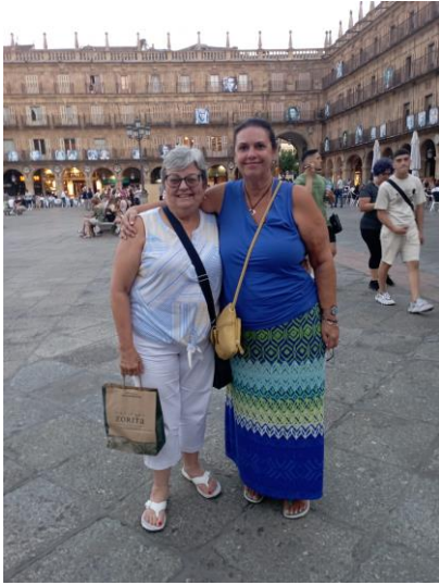
PLAZA DE ESPAÑA, SALAMANCA