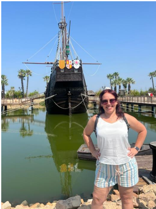
LA CARABELA DE COLÓN