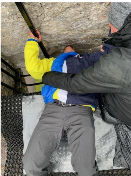
Kissing the Blarney Stone