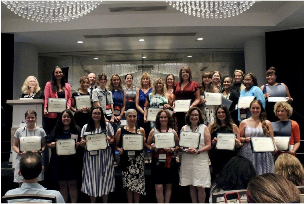
Award Winners, 2022