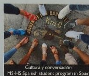
Cultura y conversación MS-HS Spanish students program in Spain