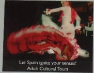
Let Spain ignite your senses! Adult Cultural Tours

Small group, 2-week immersion experience Owned & operated by bilingual, bicultural language teachers 3 exciting options: