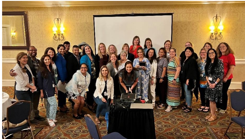
Closing and Awards Ceremony