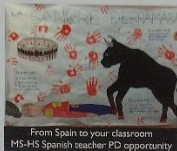
From Spain to your classroom MS-HS Spanish teacher PD opportunity